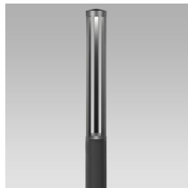
soul180 urban smart