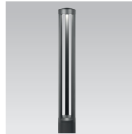
(Urban L2 - L3)