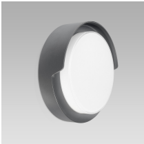
half-rim | opal