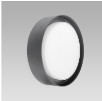
full-rim | opal