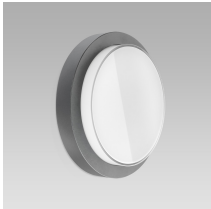
rimless | glossy