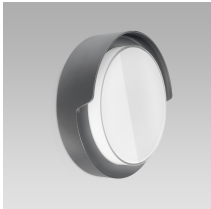
half-rim | glossy