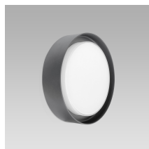
full-rim | opal