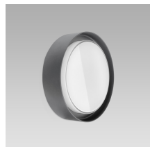
full-rim | glossy