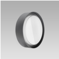
full-rim | glossy