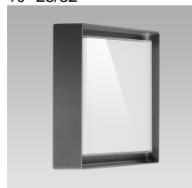
full-rim | glossy