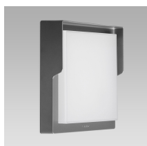
half-rim | opal