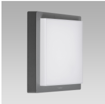
rimless | opal