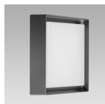
full-rim | opal