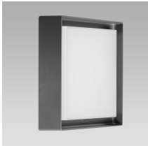
full-rim | opal