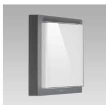
rimless | glossy