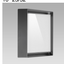
full-rim | glossy