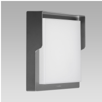
half-rim | opal