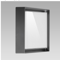
full-rim | glossy