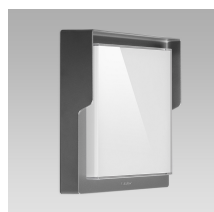
half-rim | glossy