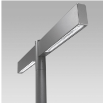
double light fitting