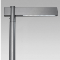
single light fitting