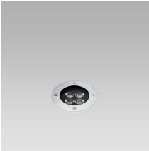
round trim flush with ground