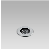
round trim above the ground