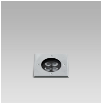
squared trim above the ground

Size: 2" 11/16 to 2" 7/8 7" 15/32 4" 23/32