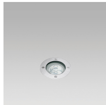
round trim flush with the ground