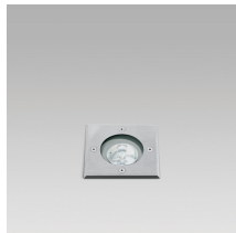
squared trim above the ground