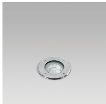
round trim above the ground