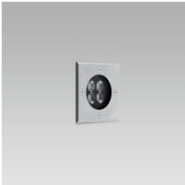
stainless steel squared trim