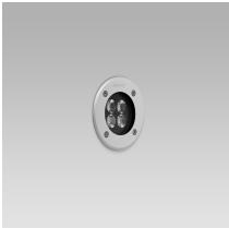
aluminium round trim