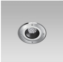
stainless steel trim