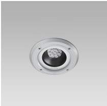
die-cast aluminium trim