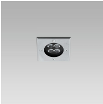
squared trim stainless steel