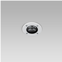
die-cast aluminium trim