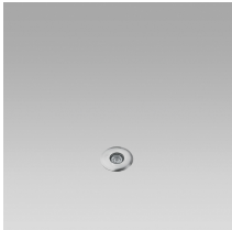
trim above the ground