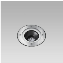
round trim flush with the ground