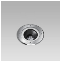
round trim above the ground